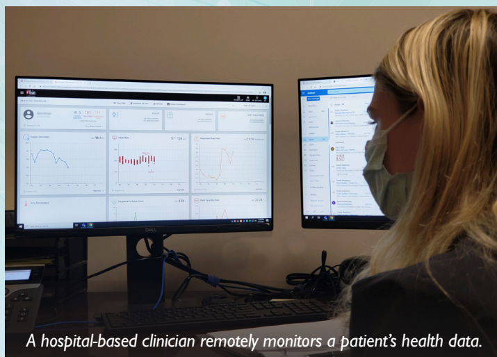
A hospital-based clinician remotely monitors a patient's health data.