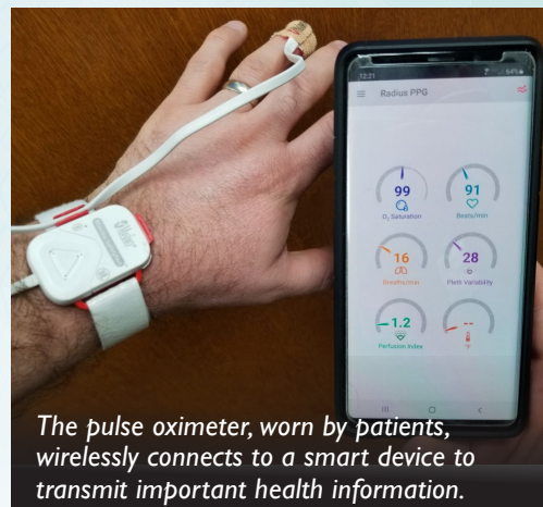
The pulse oximeter, worn by patients, wirelessly connects to a smart device to transmit important health information.